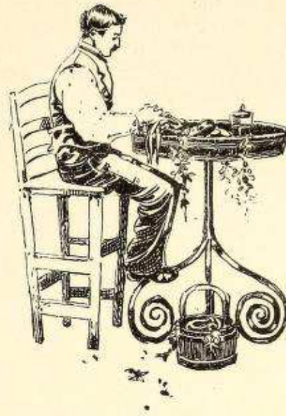
AT THE SORTING-TABLE.

The Station itself issues three important publications: (1) A series of magnificent monographs, prepared by the staff, upon the fauna and flora of the Bay of Naples. (2) A collection of papers entitled Mittheilungen . The publication of these papers was begun in 1879; they consist of articles and memoirs by the staff, and also by persons not permanently connected with the Station, but engaged there for a time in biological research. These papers may be written in any of the four principal languages, French, English, German, or Italian; and the four numbers which appear yearly make a large quarto volume. (3) The yearly "Zoölogical Record" ( Zoologischer Jahresbericht ), which furnishes lists of all the published biological works of the year, giving also a summary of their contents. This