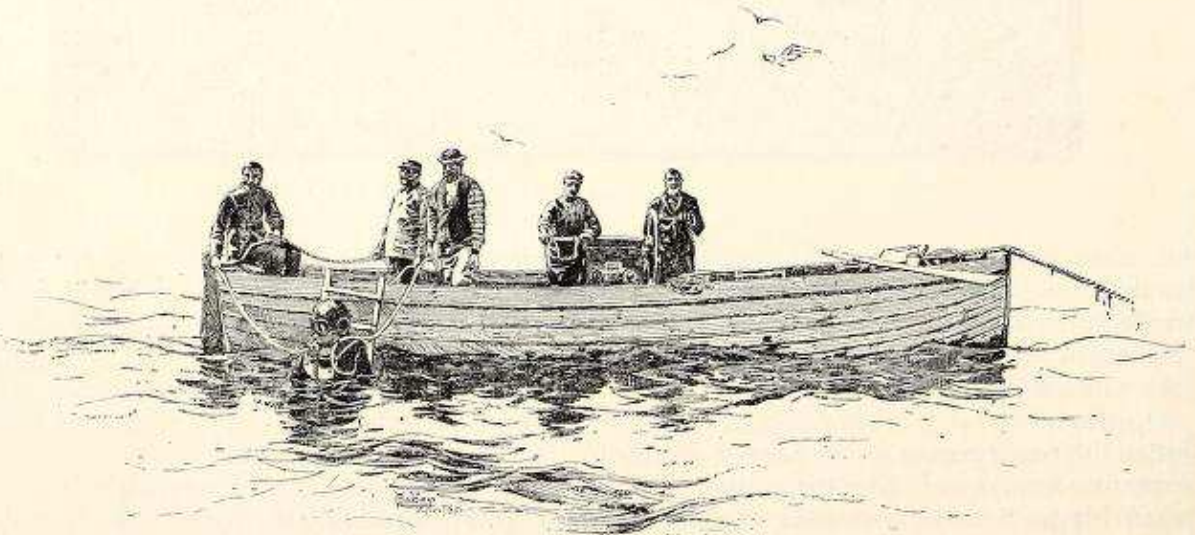
THE DIVER'S BOAT.

Station library leaves little to be desired, and its value is very greatly enhanced by the freedom with which the books may be used. They are well arranged and catalogued, and one has only to notice the simple arrangement readily to find the books he desires; then, without further ceremony, he takes them from the shelves, leaving in their places cards bearing his name, so that if any one else desires the same books he will know where they may be found.