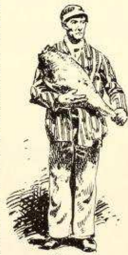
DOMENICO, THE FISHERMAN.

But we must not dwell longer on the literary productions of the Station. On the same floor with the library and great laboratory, in the rear of the building, is a series of rooms smelling strongly of the sea. They are reached also from the gardens, by a small back door and a narrow stairway. In these quarters may often be seen a dozen or so of rugged Neapolitan fishermen, who in their humble way are also doing a very important, indeed a necessary, work for the advancement of science. They may be seen bringing in loads of strange-looking mixtures, which might be said to be the refuse of sea and land. They seem to consist chiefly of broken-up plants, mixed with sand, water, dirt, stones, and formless things, among which the passer-by, if he lingers a moment, will see here and there a slow movement indicating the presence of some living thing. The uninitiated visitor would hardly think of taking a second glance into these tubs of heterogeneous things. In the early days of the Station, and before the picked crew of collectors were trained and regularly employed, considerable sums were offered to the ordinary fishermen of the bay for the animals which they accidentally took, and were in the habit of throwing back into the sea; but these sturdy fellows respected themselves too much to engage in what