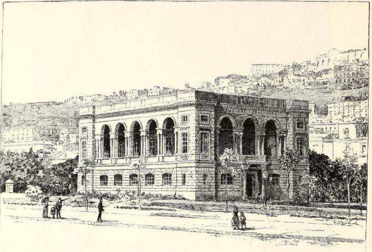
THE ZOÖLOGICAL STATION.

The progress in biological inquiries is now so rapid in every direction, the number of works published so great and constantly increasing, that the man who works by himself, not keeping up with the current literature, is soon found to be quite ignorant of the state of knowledge even in his own special line, and may be wasting his time over problems already solved. It is of the highest importance that he have access to a library which will furnish him with everything of value on his subject. The