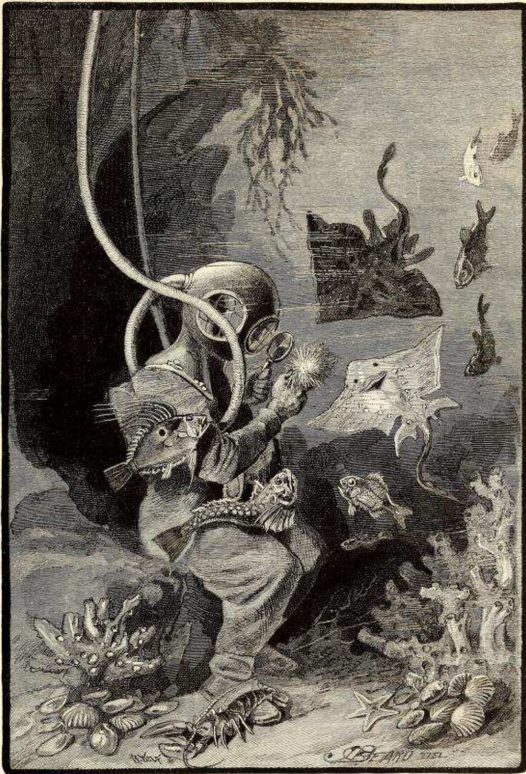
THE DIVER AT WORK.

the main passageway or into smaller halls, are thirteen other rooms, many of which are fitted up for single workers. There are also a number of small laboratories on the ground floor as well as in the third story.