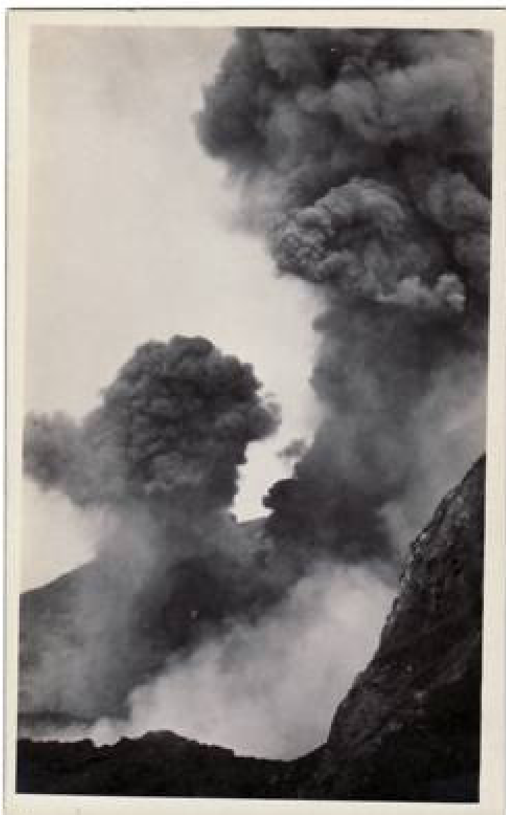
Postcard 3 (back) :