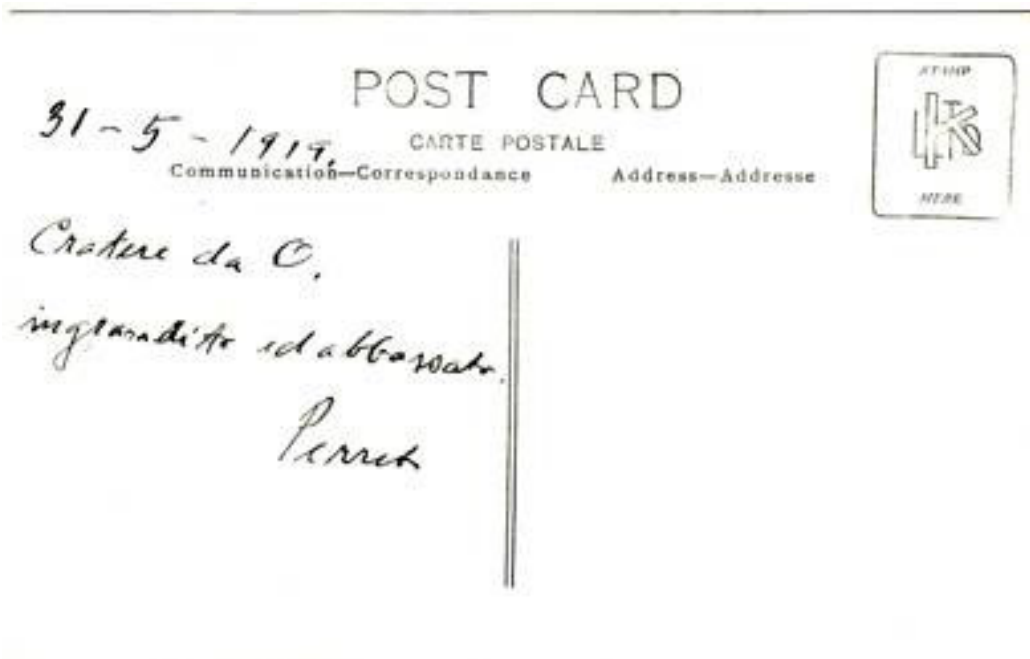
Postcard 2 (front) :