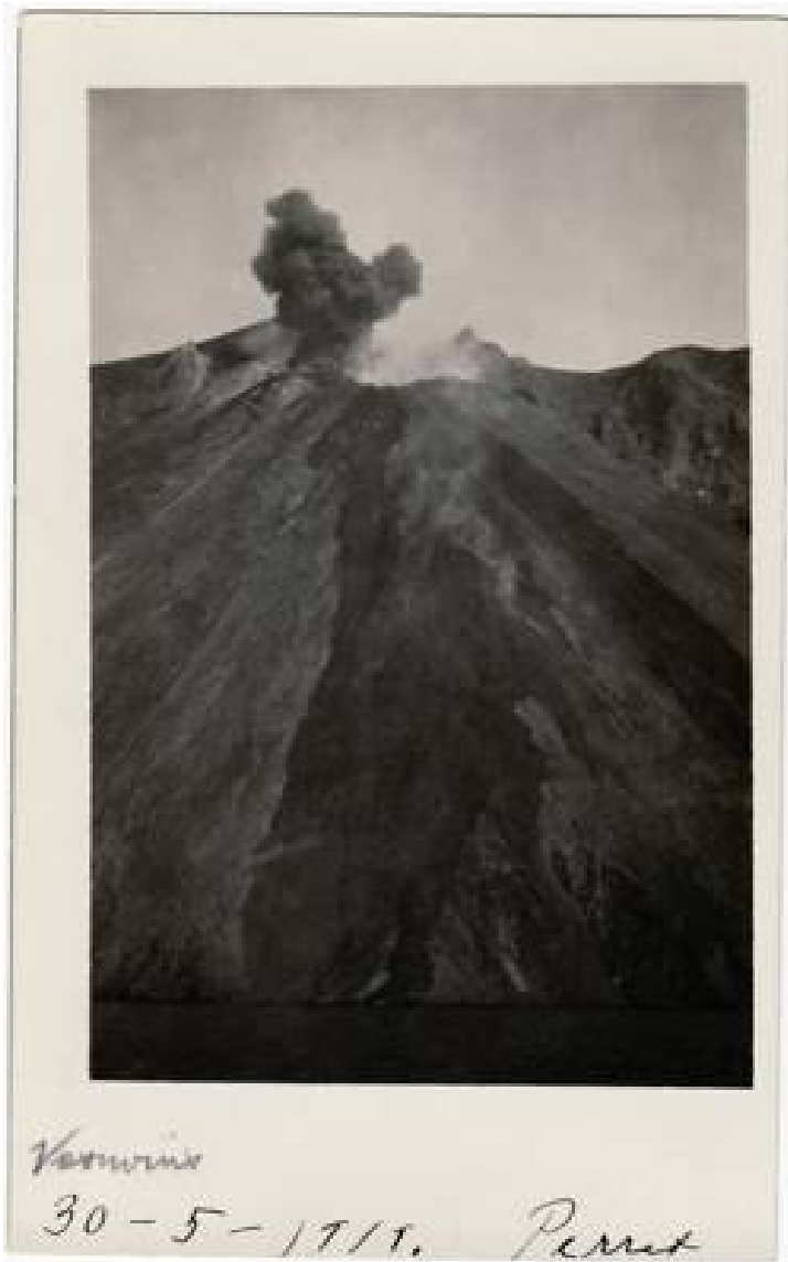
Postcard 4 (back) :