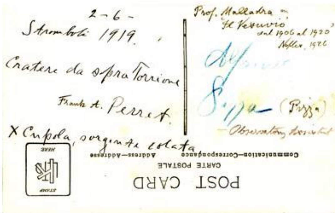
Postcard 2 (front) :