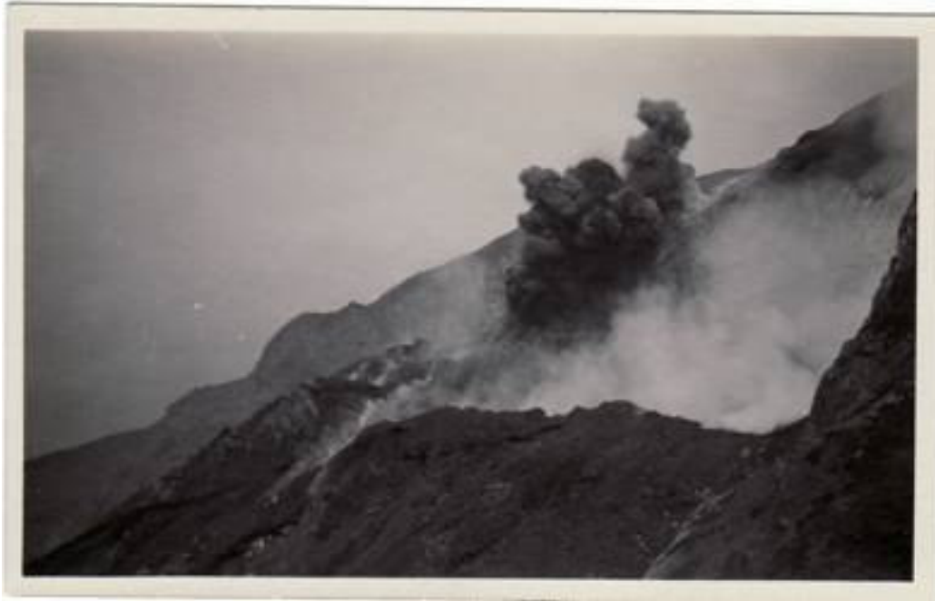
Postcard 2 (back) :